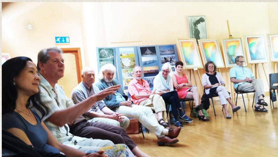
Members of the Art Section in the UK meeting in Sussex in 2015